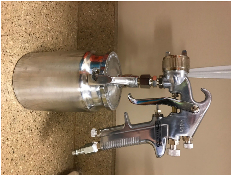
Full Connection System